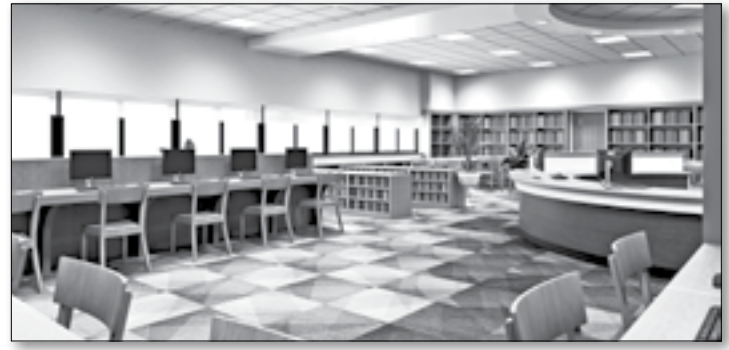
Included in this project is rennovarion of the Intermediate Education Center (IEC) Library.

Air conditioning at each of the buildings has been a strategic goal from a facilities standpoint. The intense heat that has been evidenced in August, September, October and May, June has been difficult for our students, especially in the early grades. We have had a number of students suffer heat exhaustion in some instances. This must be addressed. Currently, the Primary Education Center (PEC) and almost all of our High School are air conditioned. This project would focus on building system upgrades to the HVAC system/Air