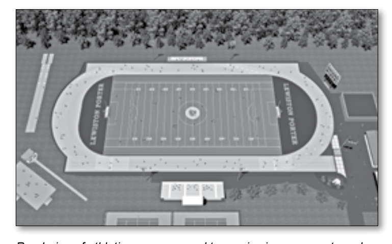
Rendering of athletic area proposed to receive improvements and updates.

renovations, upgrades, and improvements could be undertaken.